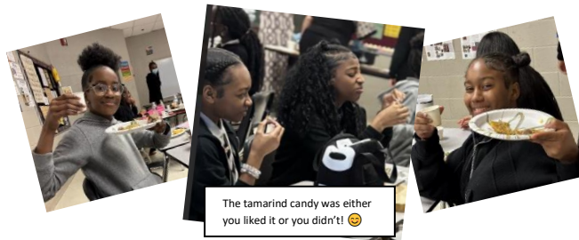
The tamarind candy was either you liked it or you didn't! 😊